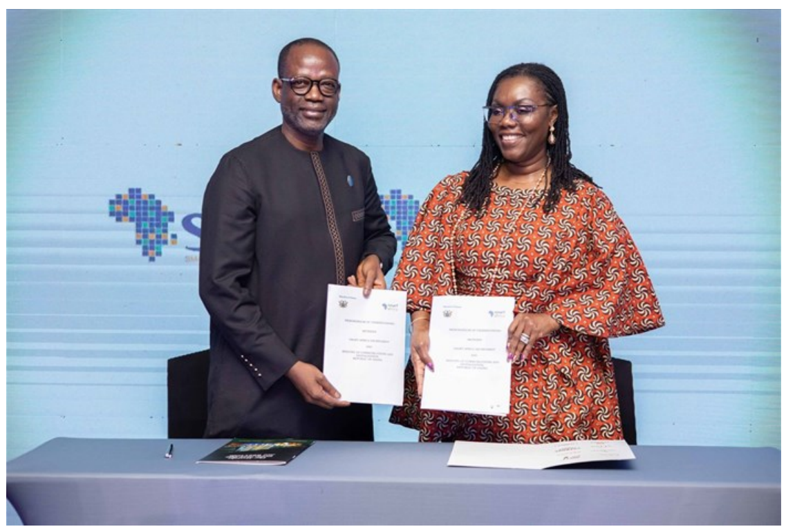
Launch of SADA national digital academy in Ghana - MoU signing

A national digital academy was officially launched in Ghana on Thursday, 19 May 2022, by the Smart Africa Digital Academy (SADA) in partnership with Ghana's Ministry of Communications and Digitalisation. The initiative forms part of a Memorandum of Understanding (MoU), which was signed yesterday by the Smart Africa Alliance and the Ministry. The Ghanaian launch follows on from the rollout of SADA national digital academies in the Republic of Congo and Rwanda earlier this year.