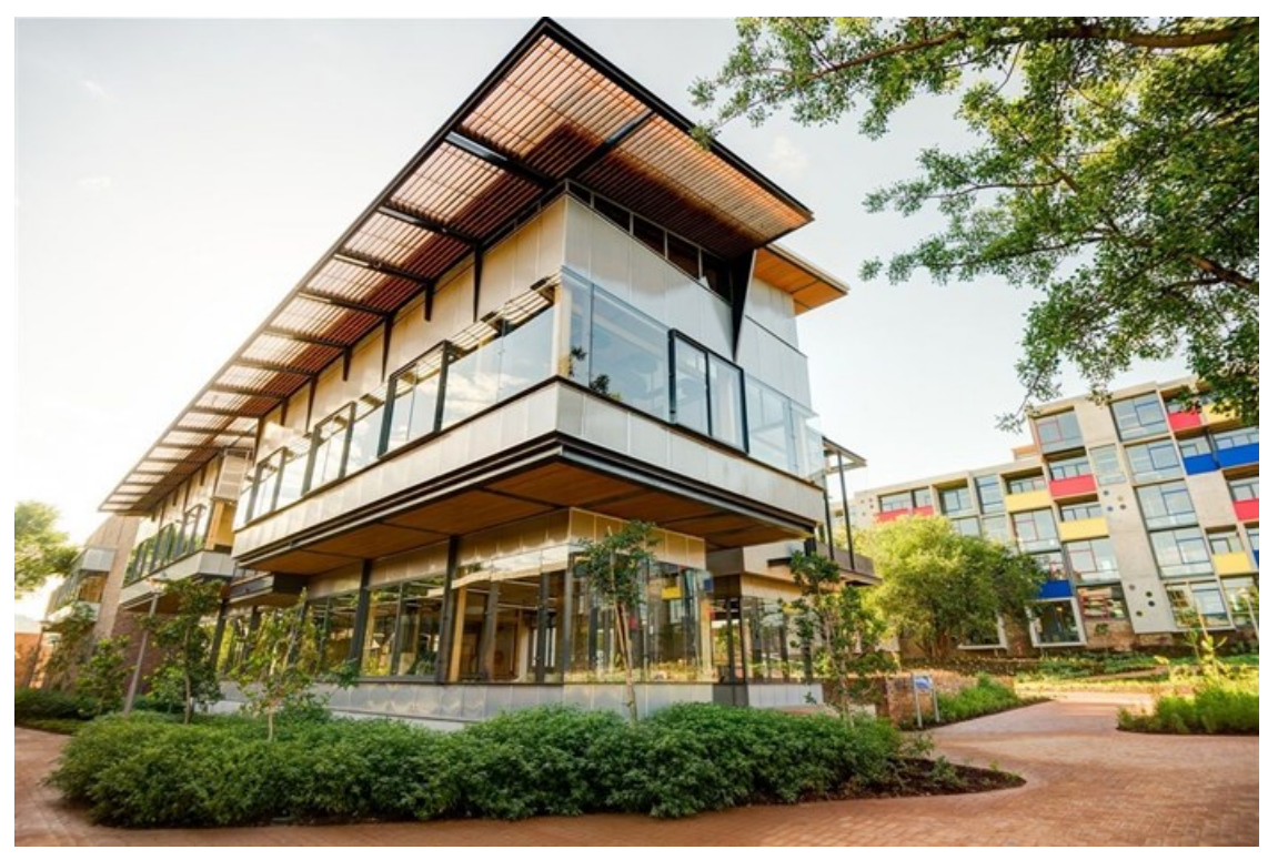
Future Africa at the University of Pretoria

The University of Pretoria has been lauded for the launch of its Future Africa research institute. The institute aims to address complex societal challenges and contribute to the achievement of Africa's sustainable, inclusive and equitable development through science, technology and innovation.