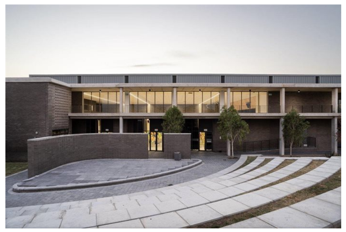
Ourro Durbanville Hgh School.

BPAS Architects has been shortlisted in the Completed Buildings - School category of the 2023 World Architecture Festival for its work on the Curro Durbanville High School. The project was completed during the pandemic and unveiled in early 2022.