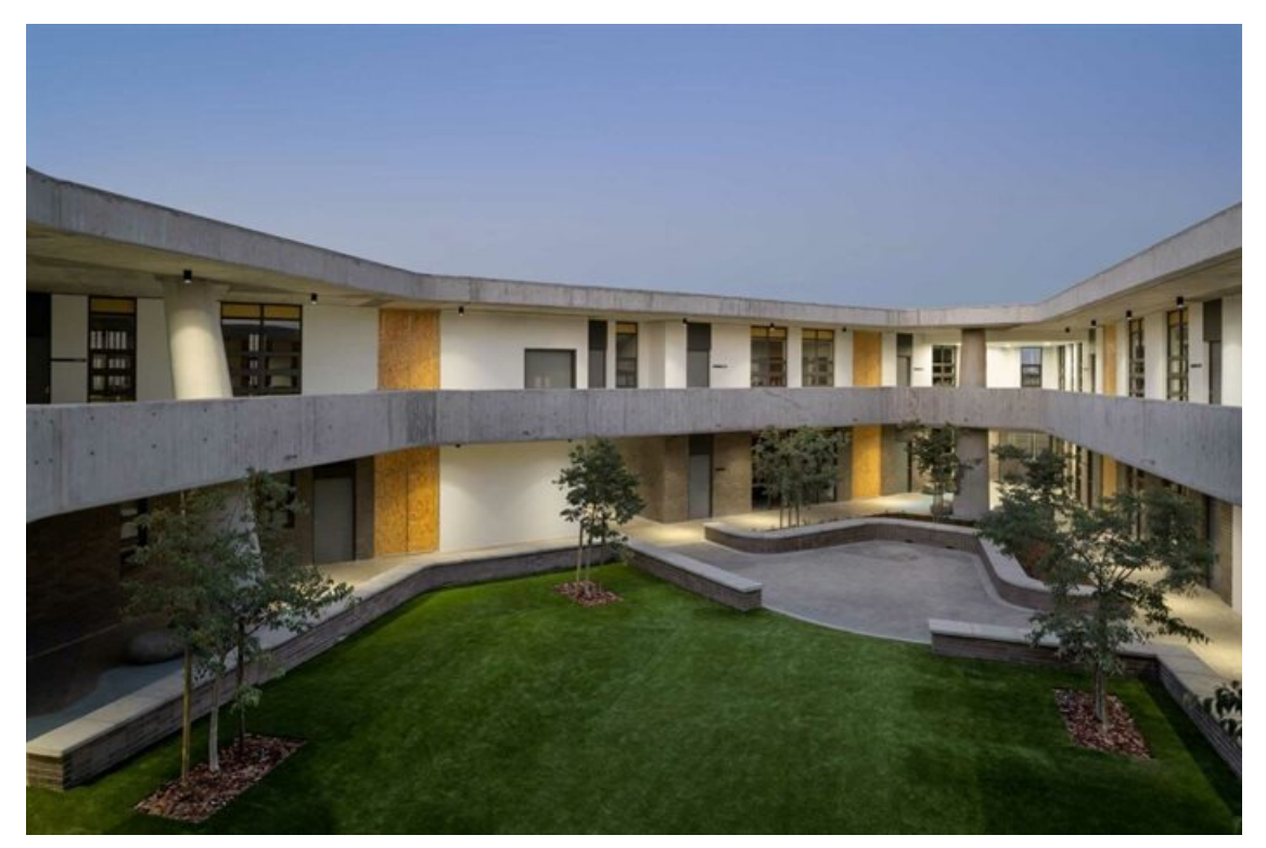
Ourro Durbanville Hgh School.

The World Architecture Festival will take place at Marina Bay Sands in Singapore from 29 November to 1 December. BPAS Architects will present their design live to an international jury and delegates, competing for the title in their category.