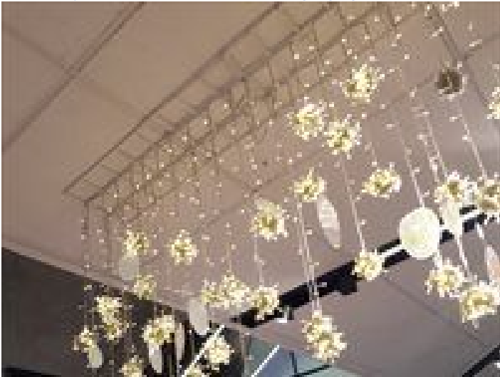
Woolworths - Decorations, visual merchandising