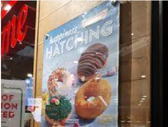
Krispy Kreme - Signage 2