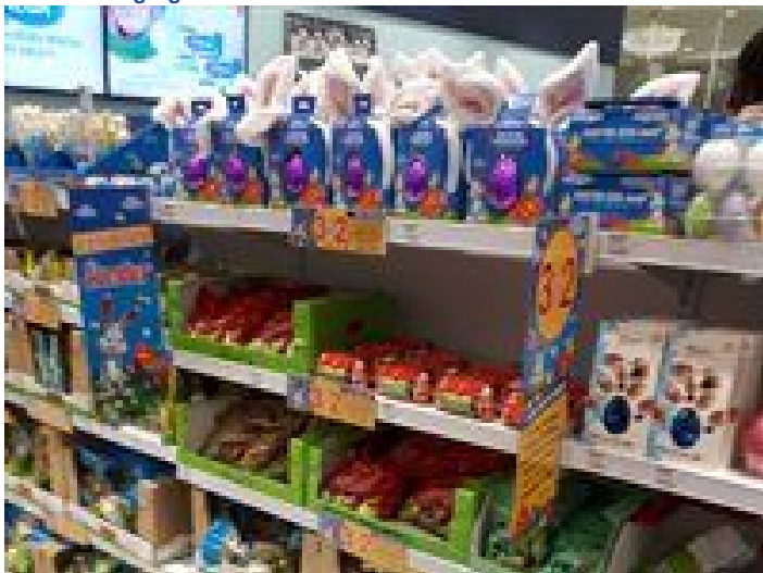
Clicks - Visual merchandising, signage