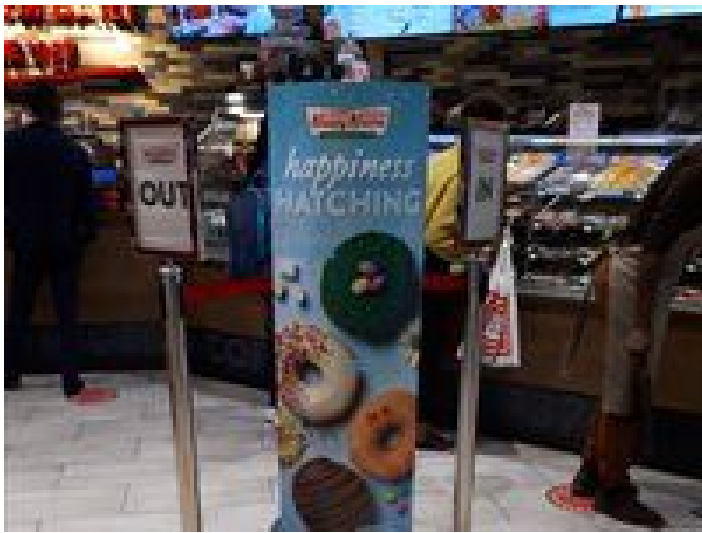
Krispy Kreme - Signage 1