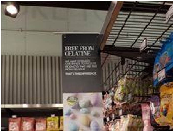
Woolworths - Signage 2