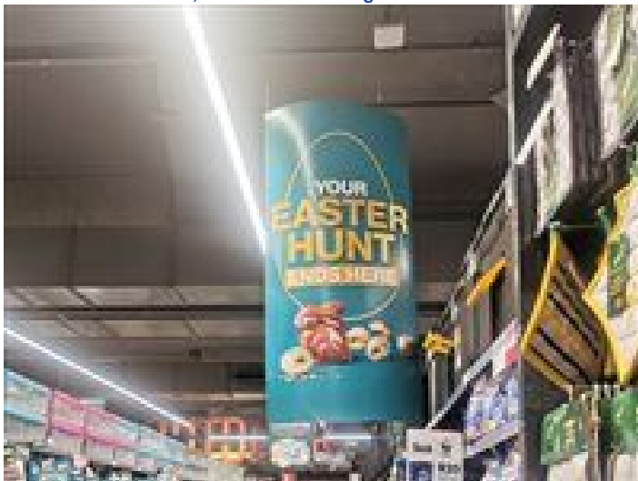
Checkers - Signage