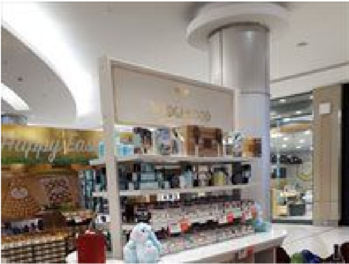
Sandton City - Decorations, visual merchandising, signage 6