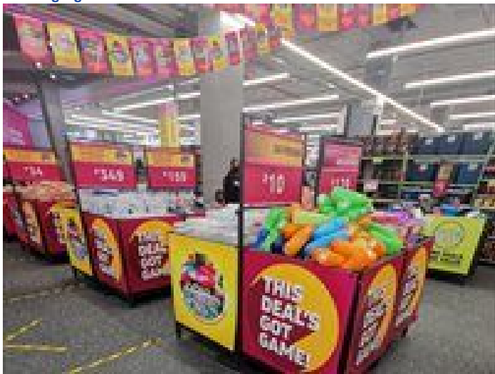
Game - Visual merchandising, signage 1