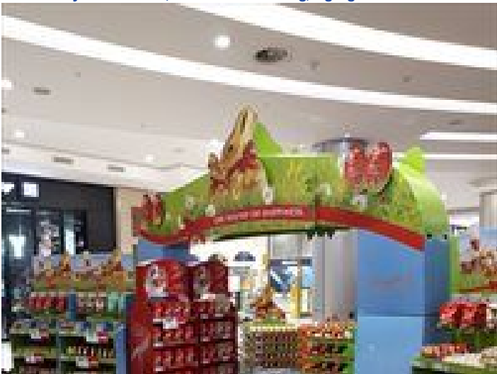
Sandton City - Decorations, visual merchandising, signage 2