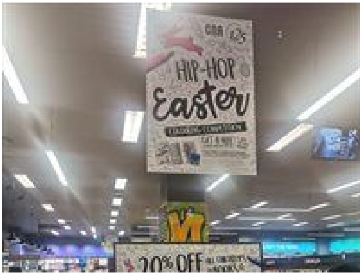
CNA - Signage