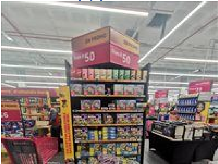
Game - Visual merchandising, signage 2