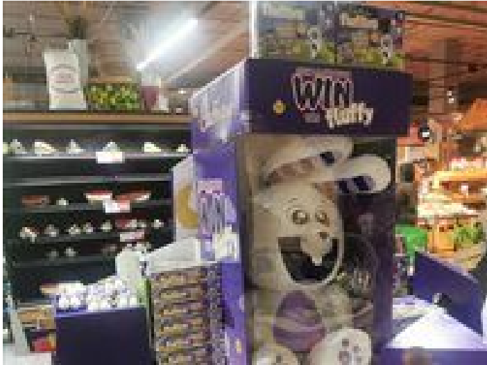
Checkers - Decorations, visual merchandising

Shop! Association has released the ' Easter at Retail World Wide 2021 ' in-store report featuring images of in-store activations and displays from 11 different countries, including South Africa. The in-store activities feature grocery retail, cosmetics and fashion. View a snapshot of SA displays below. Click here to view full the report covering Easter displays worldwide.