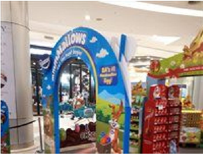
Sandton City - Decorations, visual merchandising, signage 3