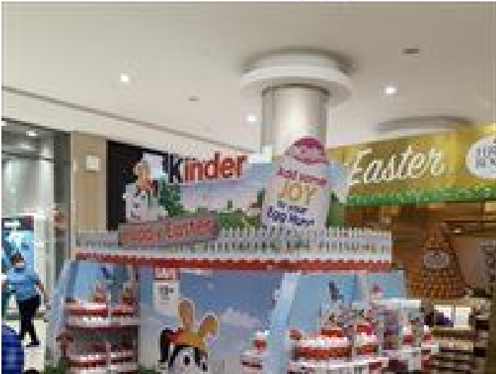
Sandton City - Decorations, visual merchandising, signage 4