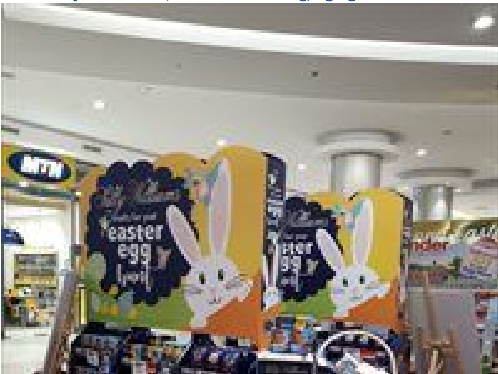
Sandton City - Decorations, visual merchandising, signage 5