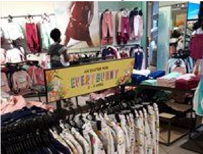
Woolworths - Signage 1