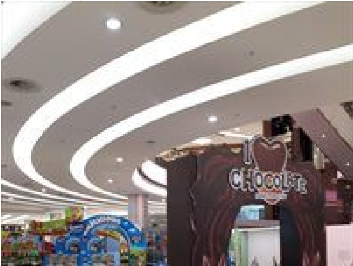
Sandton City - Decorations, visual merchandising, signage 1