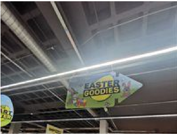
Pick n Pay - Signage