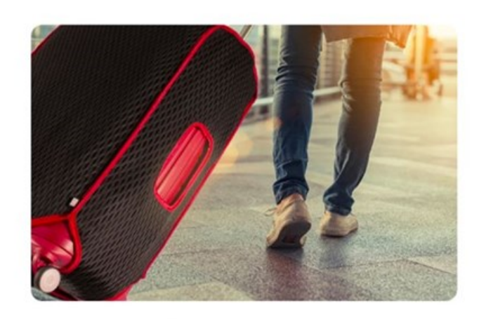
Luggage Glove is a patented invention from South Africa, developed in 2006, with a primary purpose of safeguarding your suitcase during your travels and simplifying luggage identification.

In terms of fulfilment methods, we engaged in discussions with Luggage Glove regarding two viable options: Seller Fulfilled Prime and Fulfilled by Amazon. Our recommendations factored in the specific considerations associated with each fulfilment method, as well as the pricing structure.