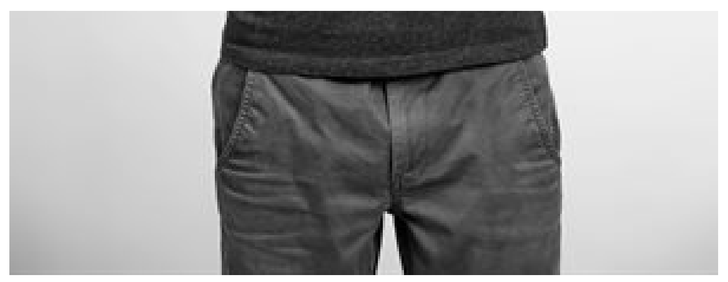
Declan Sharp Integrated creative director