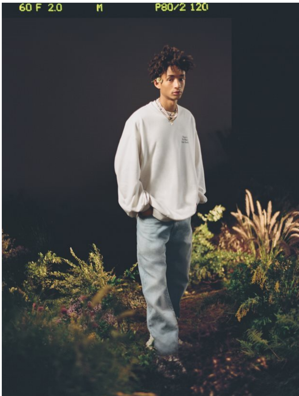
Jaden Smith's interest in water has led him to raise awareness around our planet's limited resources

“The world we live in encourages us to constantly buy. It puts us in this bad cycle. I’m glad that Levi’s® is changing that message by making thrifting cool. Some of my favorite pairs are thrifted. And I’m even more happy to see that Levi’s® is supporting these amazing young voices who are all speaking up for the environment.” — Jaden Smith