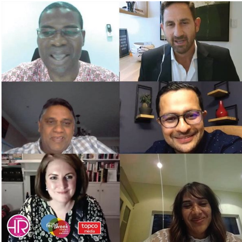
Some of the 2020 Africa Tech Week & Future of HR award winners