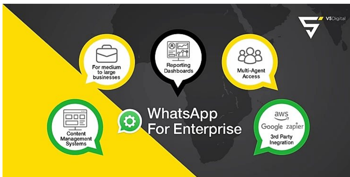
Selected WhatsApp Enterprise functionalities

Hellman's Mayonnaise used a WhatsApp chatbot to engage with over 13,000 consumers who received recipes from the bot based on what was in their fridge. Absolut Vodka concocted a chatbot called Sven, who consumers had to persuade however possible to give them tickets to an exclusive Absolut party – generating massive buzz and earned media for the brand. South Africa's Standard Bank launched a WhatsApp chatbot to keep customers informed around its services during Covid-19.