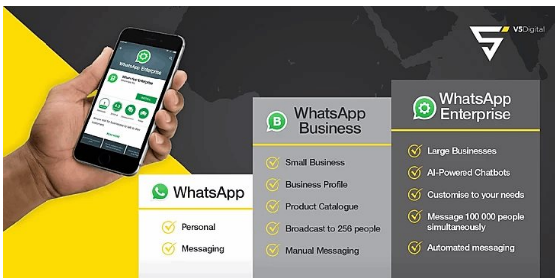
The difference between WhatsApp, WhatsApp Business and WhatsApp Enterprise

One rung up from that is WhatsApp Business. It's a standalone app that allows small businesses to communicate with their customers. The app allows clients to view the businesses profile to see details like opening hours, the product catalogue, website links and more. Automated messaging caters for away messages (when someone from the business can't reply for a period of time) and a welcome message when a consumer first lands on the line. Instant Replies is a feature that saves business owners time because they can pre-program answers to FAQs to avoid having to write out the same response over and over again.