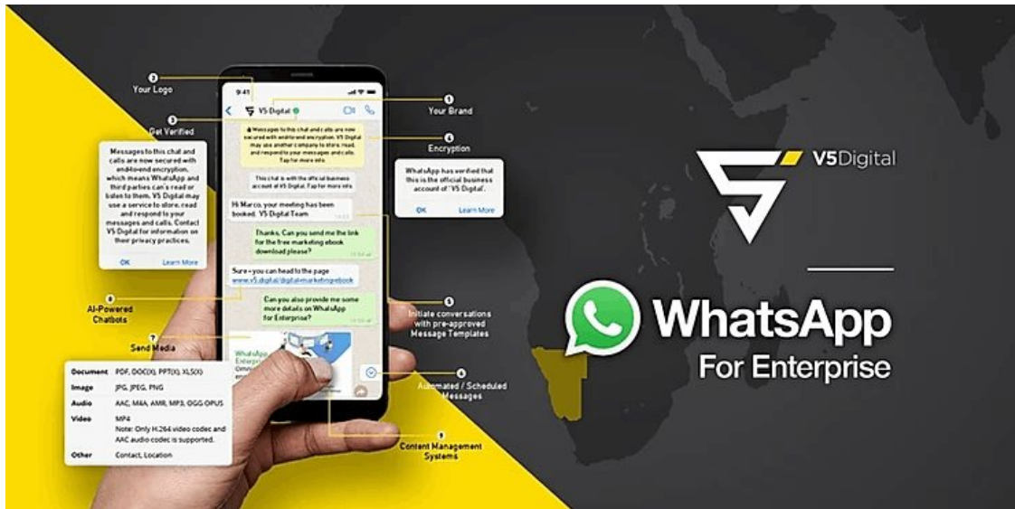
V5 Digital will accelerate your WhatsApp Business and WhatsApp Enterprise implementation

WhatsApp Enterprise coming to Namibia is a big deal for brands. But why all the hoopla? First of all, we need to get some clarity on the difference between WhatsApp, WhatsApp Business and WhatsApp Enterprise. We all know regular WhatsApp - it is the juggernaut of messaging platforms used by the majority of Namibians . The average Namibian checks their WhatsApp a few times every hour, as it's the platform they love and trust.