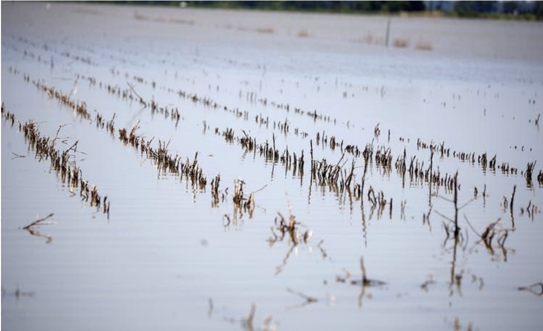
Farm land near Holly Bluff, Miss., covered with backwater flooding, May 23, 2019.

Farmers are used to dealing with weather, but climate change is making it harder by altering temperature and rainfall patterns , as in this year's unusually cool and wet spring in the central U.S. In a recently published study, I worked with other scientists to see whether climate change was measurably affecting crop productivity and global food security .