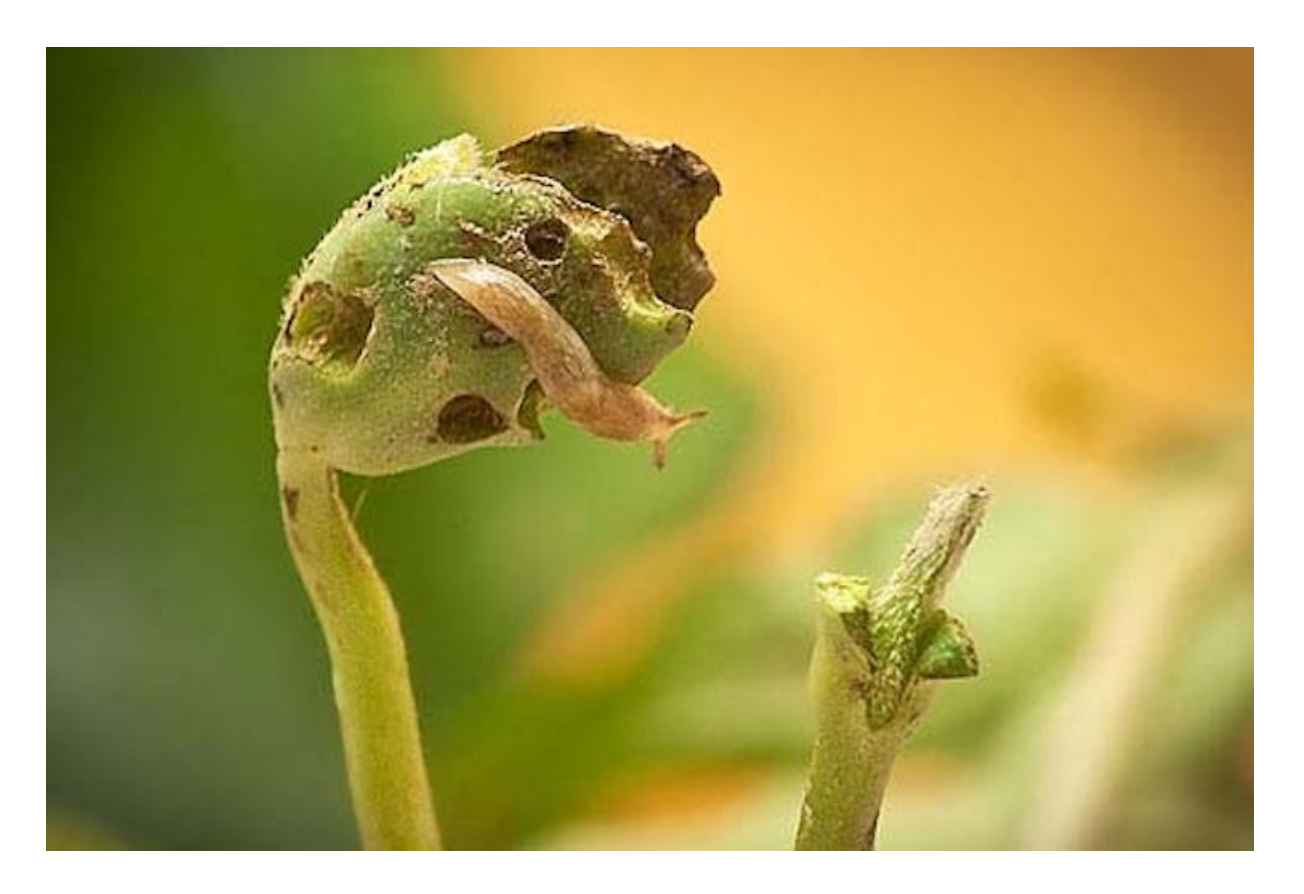
Slugs, shown here on a soybean plant, are unaffected by neonicotinoids, but can transmit the insecticides to beetles that are important slug predators.