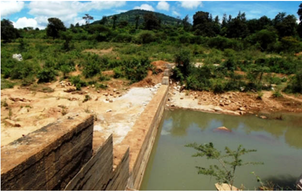
Just a Drop

One sand dam is capable of storing up to 20m litres of water, supplying up to 1,000 people with water all year round.