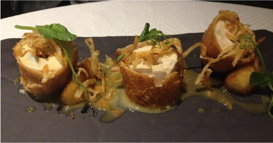
Blue cheese stuffed chicken breast with caramelized apple