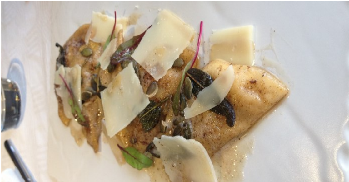
Butternut ravioli with a sage sauce and parmesan