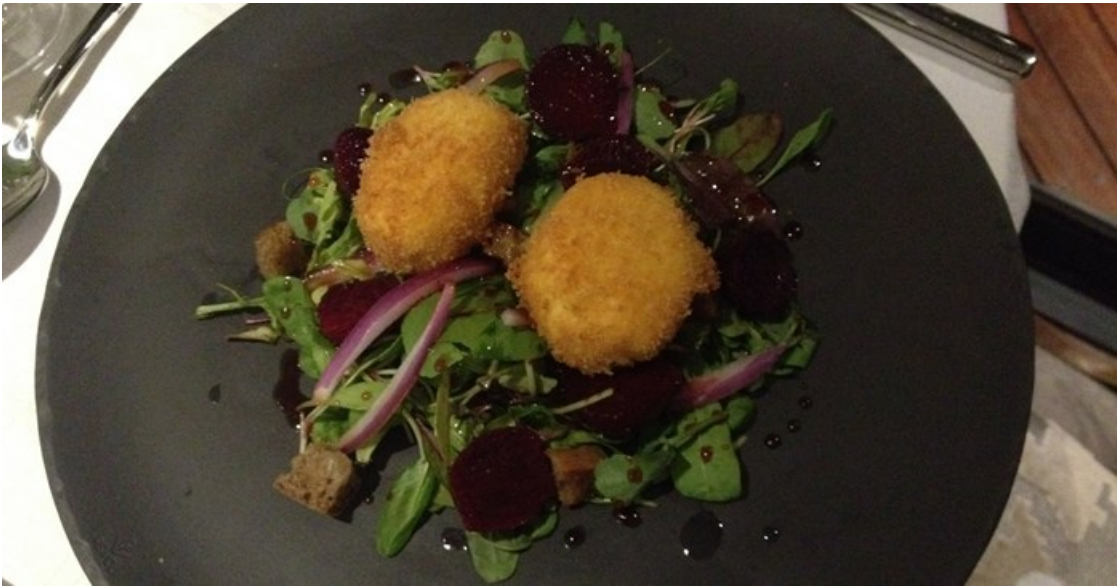
Deep fried goat cheese and beetroot salad