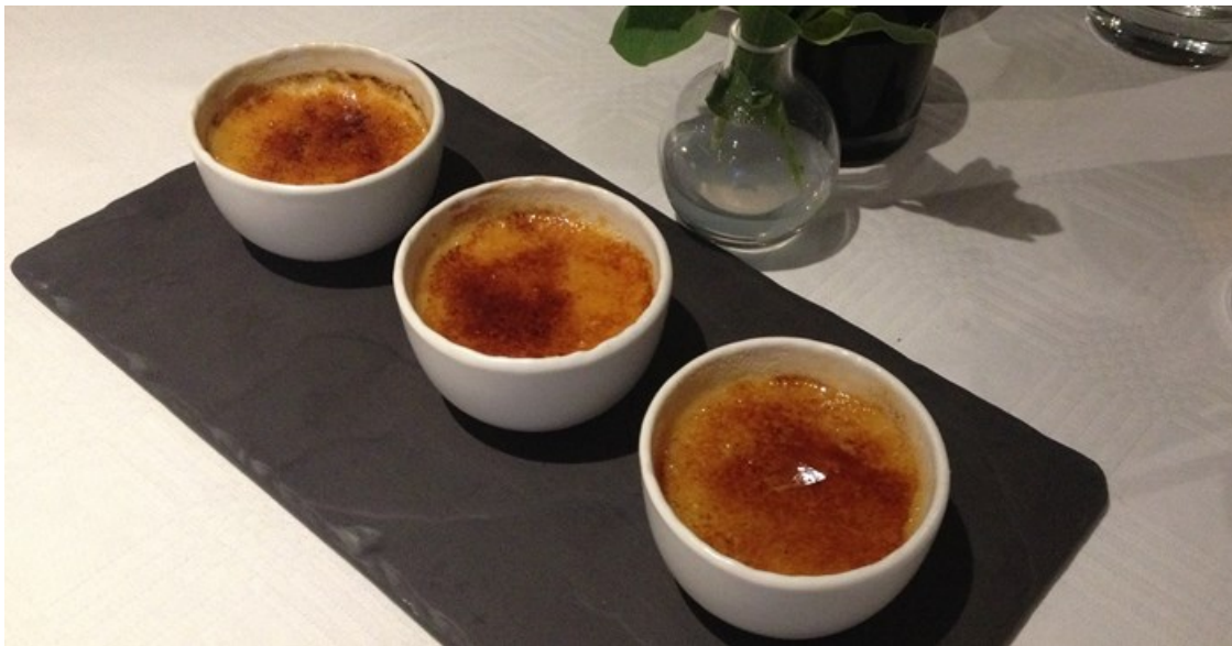
Trio of creme brulee that is full of delicious surprises

You don't have to be a guest to enjoy the culinary delights chef Correia cooks up. The Restaurant will be open to public – all you need to do is make a reservation.