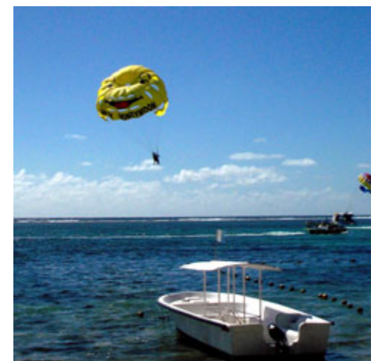
Honeymoon couples doing it as it should be done...

(You'll find a general overview and more about (getting married in Mauritius here) and more about getting married at Long Beach, specifically, here .