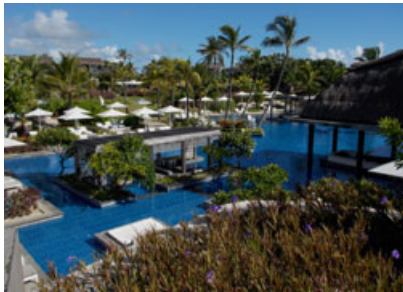
Feel like a dip? There are pools aplenty.

First of all, the service is unchanged - excellent.