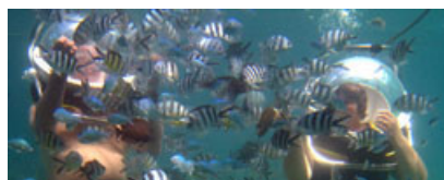
"Captain Nemo, I presume. Ah!"

And then it's into the water. Make sure you wear sandals as you are walking on coral and bare feet are a no-no.