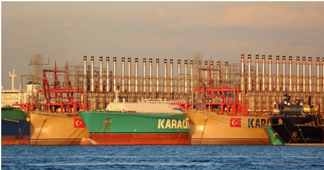
Karadeniz Powerships KPS Orka Sultan, KPS LNG Anatolia and KPS Orhan Ali Khan are pictured at Altinova port in the Gulf of Izmit, Turkey.

A dispute over unpaid bills of about $40m has led to power outages in Freetown, the capital of Sierra Leone. The energy provider, Turkey's Karpowership, shut down its electricity supply on Friday, leaving many residents in the dark.