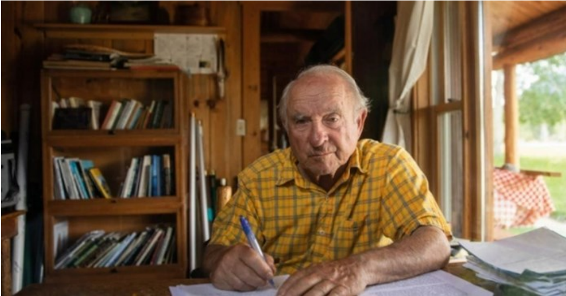
Yvon Chouinard, Patagonia founder.

Yvon Chouinard, the founder of outdoor apparel brand Patagonia, and his family have transferred ownership of the company to two new entities, Patagonia Purpose Trust and the Holdfast Collective, which will direct all profits towards protecting the environment and fighting the climate crisis.