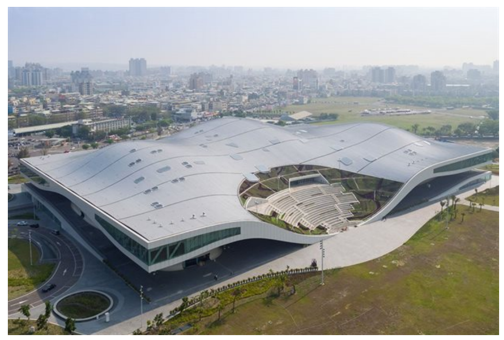
Mecanoo's Arts Center in Taiwan.

Whilst one of last year's winners, Studio Gang, tackles environmental concerns at a volumetric level through its 'Solstice on the Park' project – a 26-storey residential tower in the USA optimised for environmental performance through angled window panels which are slanted inwards at 72 degrees — the precise angle at which the sun hits the Chicago skyline at the height of the summer solstice.