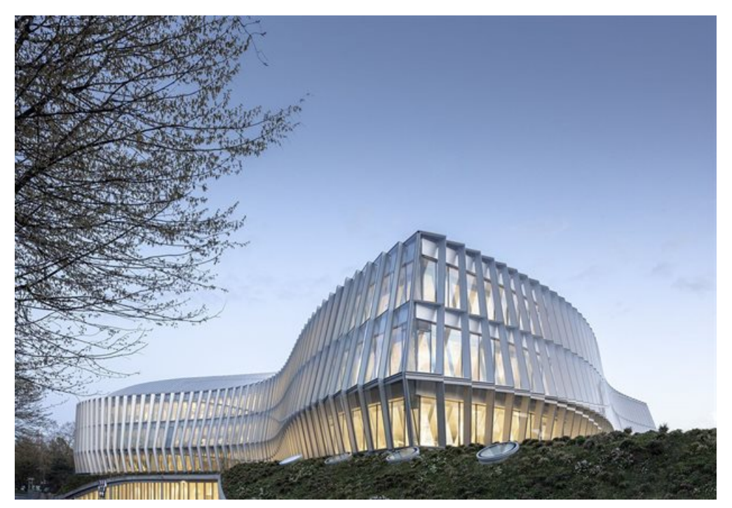
3XNs sinuous Olympic House in Lausanne.

Amongst the shortlist is an eco-airport in Singapore designed by Safdie Architects centred around a 15,000m<sup>2</sup> state-of-the-art, indoor public garden, which features a 40m indoor waterfall falling through the centre of a doughnut-shaped glass roof, alongside 3,000 trees and 100,000 shrubs from around the globe.