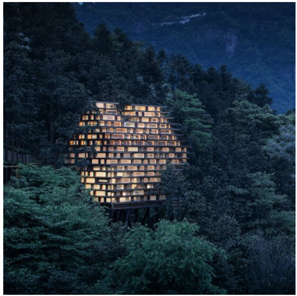
Shanghai Jund Architects' Pine Villa, Huangshan, China.

The World Architecture Festival has announced its 534-project shortlist for 2019, among which are ALA Architects, Mecanoo, Heatherwick Studio, JKMM Architects, Rogers Stirk Harbour + Partners, Zaha Hadid Architects, Studio Gang, and BIG.