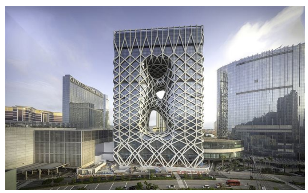
ZHA's Morpheus Hotel in Macau.

In the culture category, Helsinki Central Library Oodi by AL_A Architects, whose founder Amanda Levete is a founding member of Architects Declare, heralds a new era of library design where traditional functions meet modern technology to create an almost zero-energy building with panoramic views.