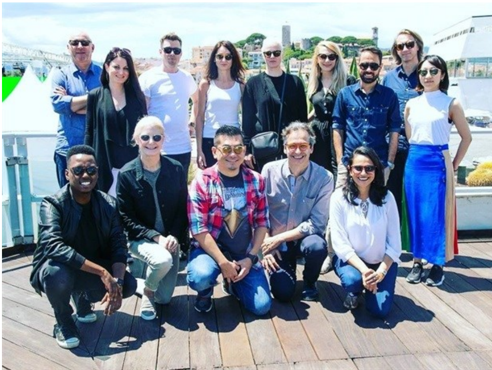
The Cannes Lions Design Lions jury 2018.

Having people of your kind in a foreign country always feels like a home away from home. Cannes was a great and inspirational experience overall, creatively and personally. I felt honoured and privileged by the opportunity to judge at this level.