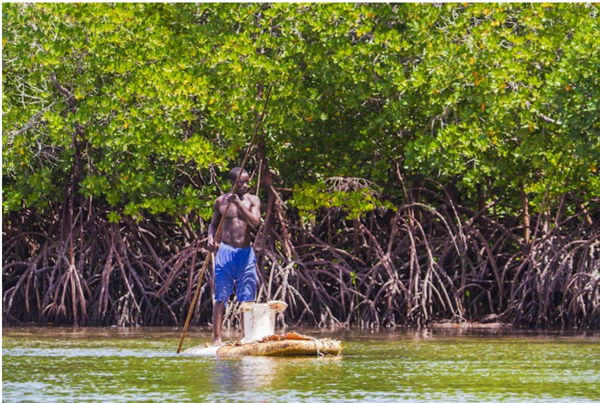
Local fisherman fishing in Mida Creek mangroves, Watamu.

Kenya currently manages just 1% of its ocean territory in protected areas, most of which is in marine reserves, which allow fishing. So it's unlikely the country will meet the target of 10% by 2020. But by taking steps to empower local communities to manage reserves on the shoreline combined with setting aside larger offshore areas to preserve fishing stocks for the future, it could be possible to establish sufficient momentum to reach 30% by 2030.