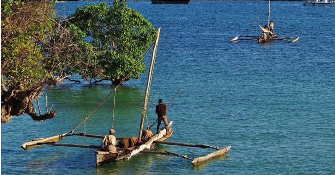
Fisherermen on their traditional boats near Shimoni (Kenya)

Kenya earns around $2.5bn per year from its ocean - less than 4% of its GDP. This shows the potential for growth which could raise peoples' incomes in coming years. But it won't happen unless damaging practices and declining resource and ecosystem health issues are dealt with.