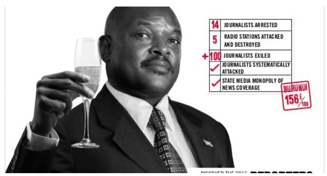
Burundi President Pierre Nkurunziza

Designed by the Paris-based advertising agency BETC for RSF's 2016 World Press Freedom Index, the campaign focuses on leaders in 12 countries who have trampled on media freedom and gagged journalists in various spectacular ways.