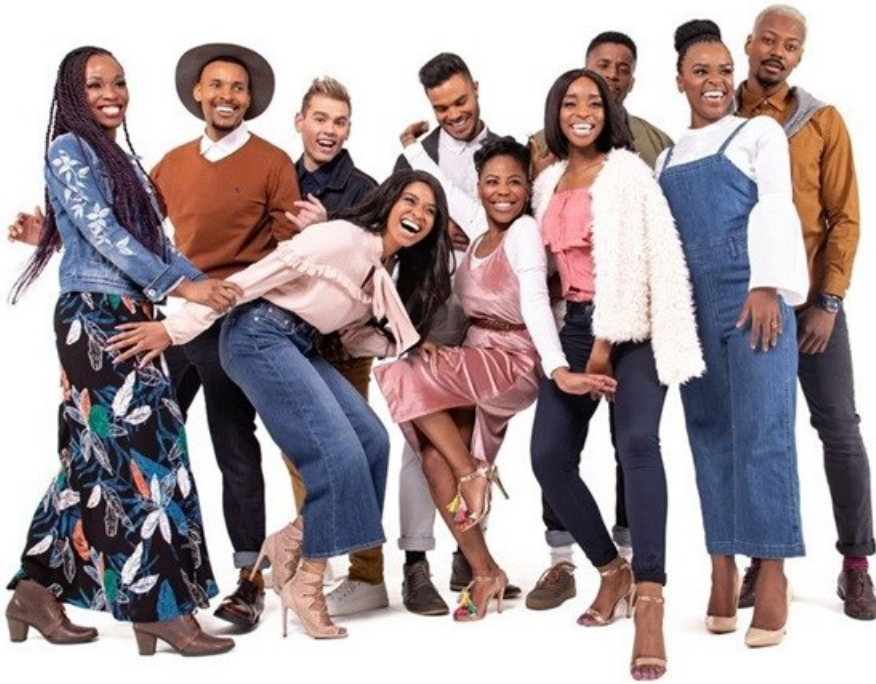
This year's top ten finalists for the Presenter Search on 3.

The worst part is definitely be the eliminations. Knowing that someone's journey and dreams could come to an end just like that. Not because they were bad, but because of a minor slip-up.