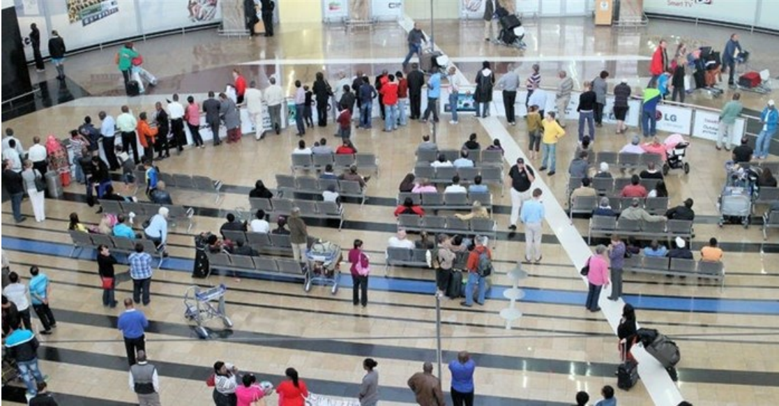
People in the arrival hall at the O.R. Tambo International airport

Overall SA tourist arrivals are down -6.8% for 2015 compared to arrivals recorded during 2014, despite a strong finish for South African tourism in the final quarter.