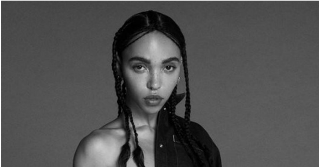
FKA twigs stars in the controversial ad.

The case involving the UK's Advertising Standards Authority (ASA) and the Calvin Klein advertisement featuring British singer FKA twigs has been partially overturned.