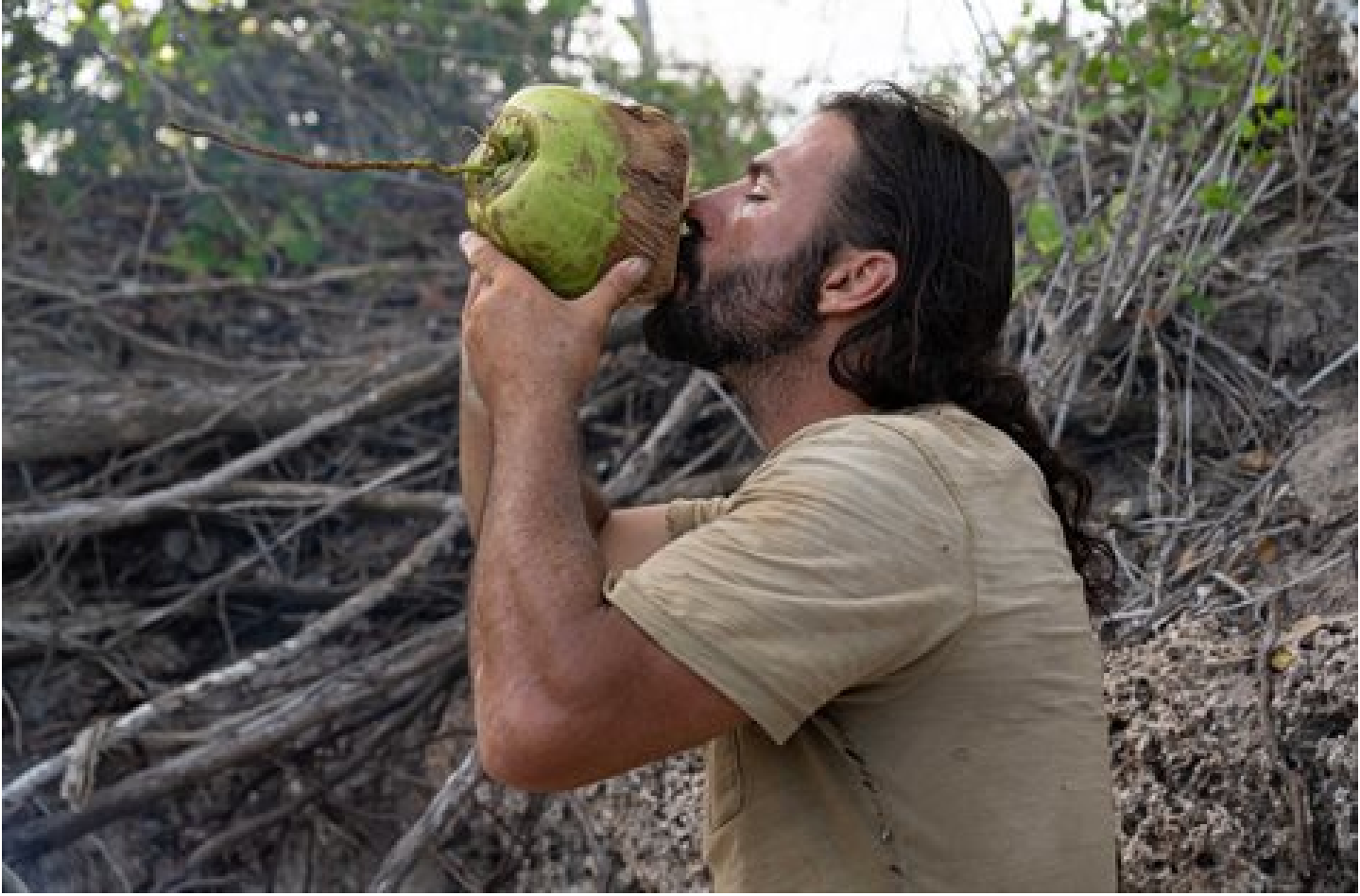
Primal Survivor: Extreme African Safari: Serengeti