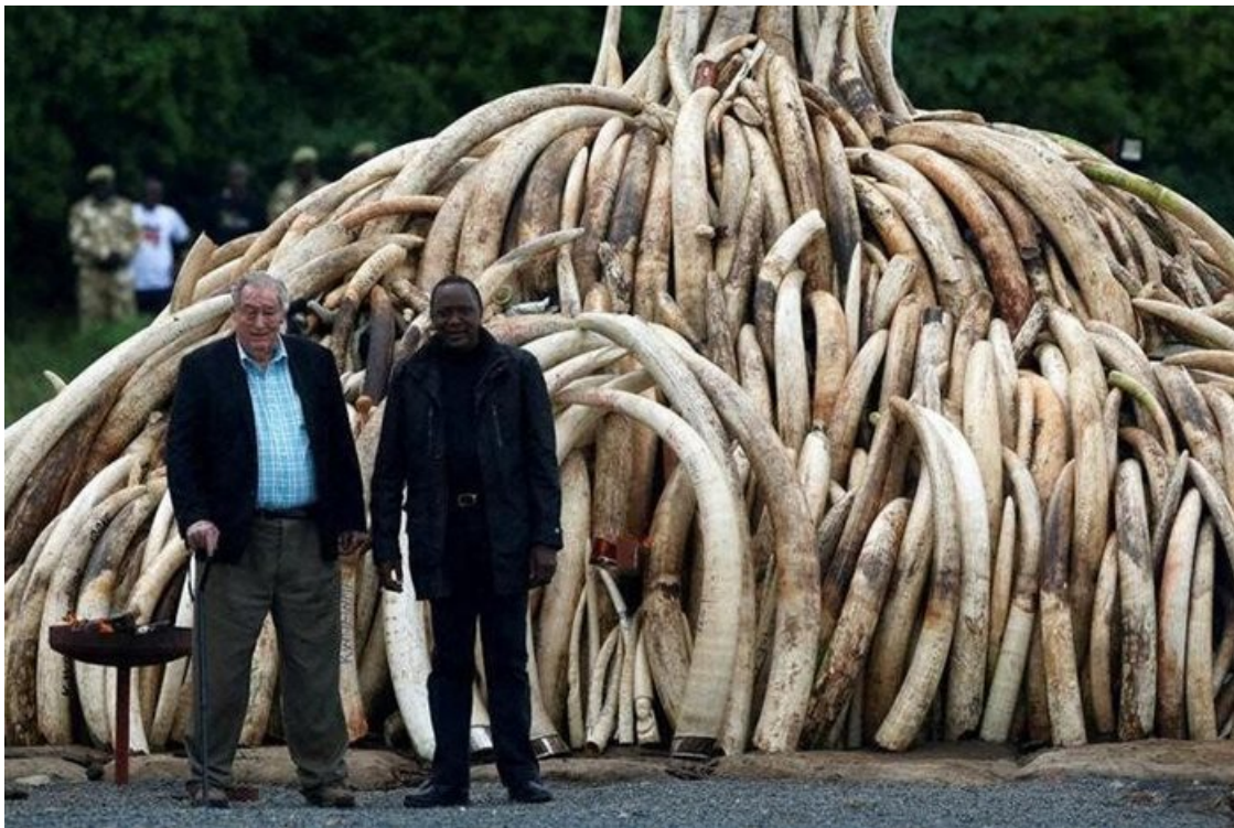
Kenyan President Uhuru Kenyatta (right) and chairperson of the Kenyan Wildlife Service (KWS) Richard Leakey (left) pose for the press after the president lit on fire parts of an estimated 105 tonnes of ivory and a tonne of rhino horn confiscated from smugglers and poachers at the Nairobi National Park near Nairobi, Kenya, 30 April 2016.

"Very courageous, he was a person who stood for integrity, whether it was in wildlife conservation, whether it was related to archaeological and paleoanthropological research at museums or whether it was related to politics," she said.