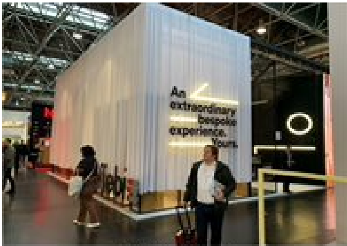
Use of fabric-draping for walling.