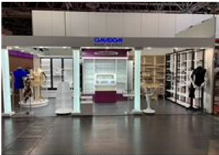
Shelving and display solutions.