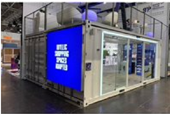
Container store design.