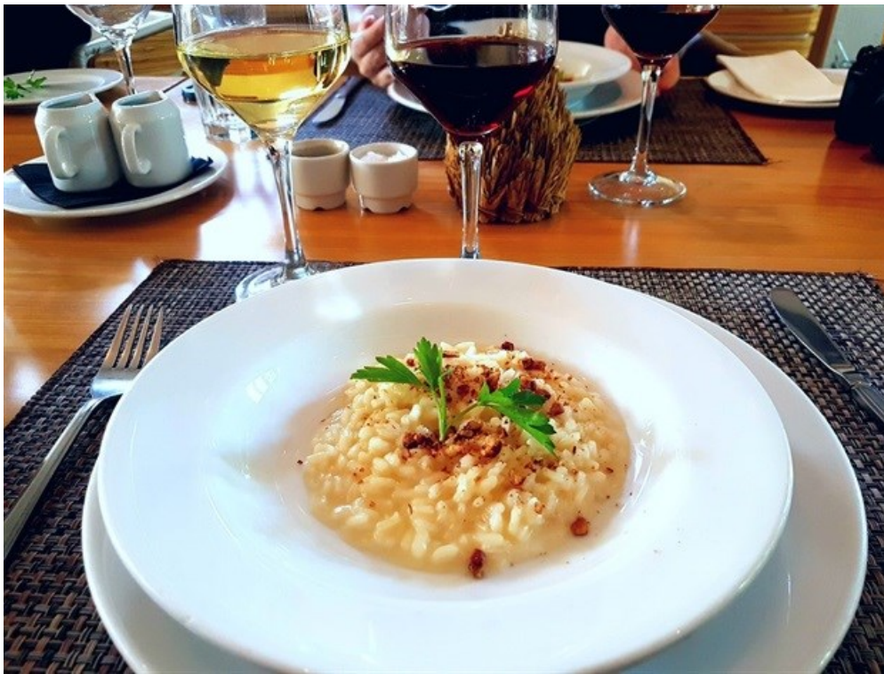
il Risotto al Formaggio e Noci at 95 Keerom

We had all eaten every mouthful of the previous courses, so were worried we were going to have trouble with the final courses, especially as these were now full portions.