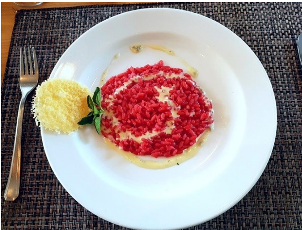
il Risotto alle Barbabietole e Gorgonzola at 95 Keerom

The fourth course of beetroot and blue cheese – il Risotto alle Barbabietole e Gorgonzola – was the one to beat, a pleasing bright pink with light Gorgonzola zing, served with a strong Parmesan crisp.