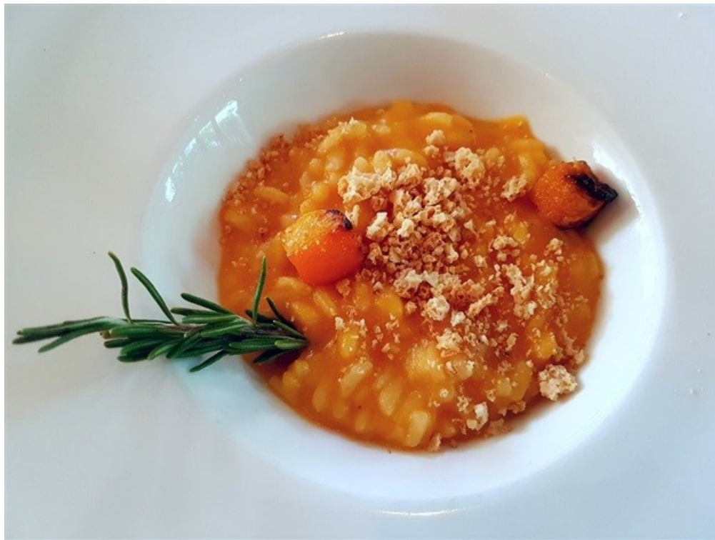
|| Risotto alla Zucca e Amaretti at 95 Parks.

While we never steered from creamy risotto, the flavours were brimming with warmth and made us go ‘Mmm!’ With all five plates emptied and our wine glasses drained, we stood with a touch of sadness and left the lovely meal.