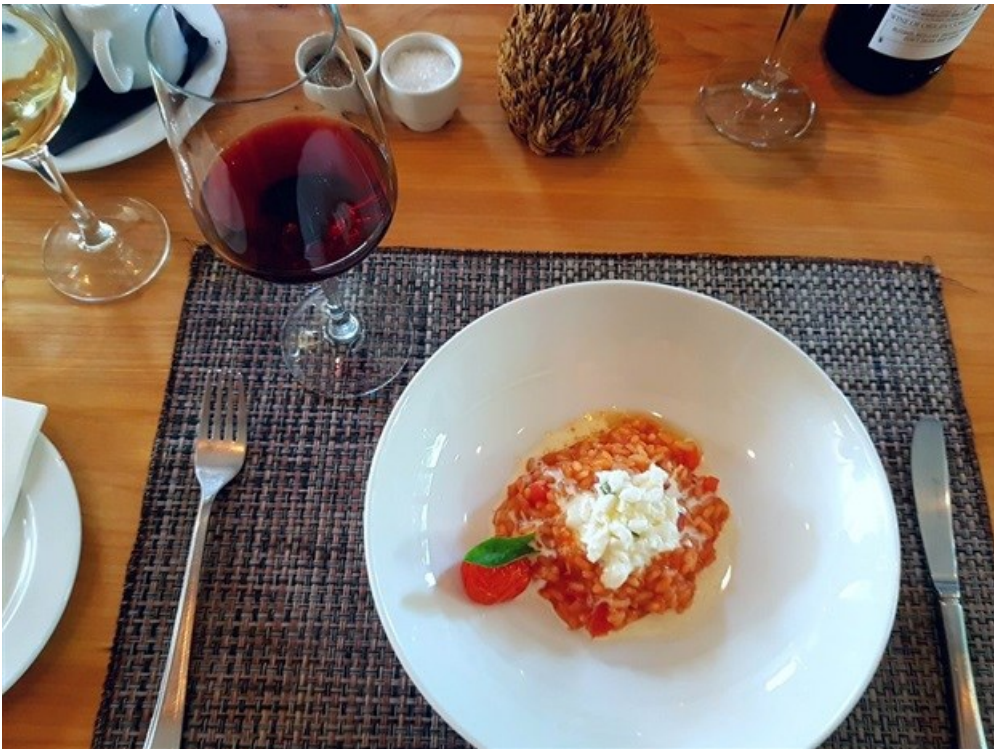
il Risotto al Pomodoro e Stracciatella at 95 Keerom

A fantastic plate paired with the red Steenberg Nebbiolo, this is a next-level 'cheese and tomato' dish! It was creamy and tart in all the right places.