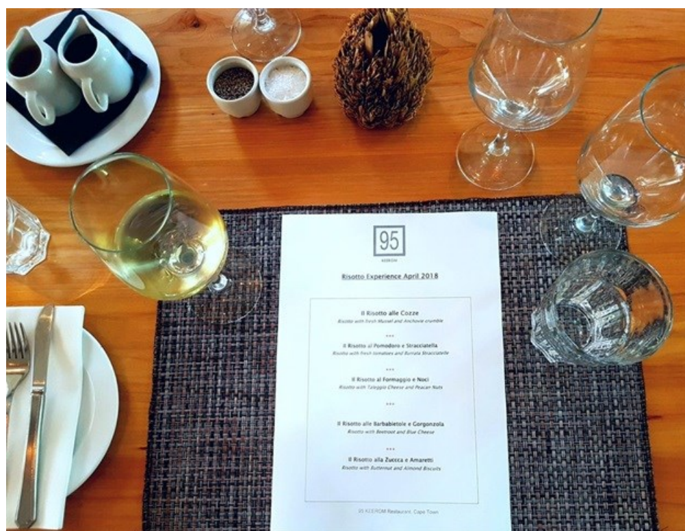
The Risotto Pop Up at 95 Keerom.

I love nothing better than indulging in Italian food when we start approaching the winter months. My waistline may not love it, but my taste buds certainly do. That's why I jumped at the chance (pity that doesn't count as exercise) to sample the #risottopopup that's running at 95 Keerom from 9 April to 5 May.