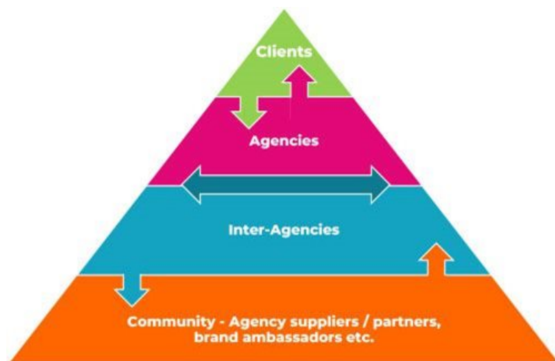
Channel Partnership Pyramid of Value Creation

Corporate marketing ecosystems are complex. Large internal teams spanning brand, digital, trade and public relations (the list goes on!) are supported by a network of supplier marketing agencies - who all, in turn, have their own networks of partners and suppliers (collectively this is "the channel").