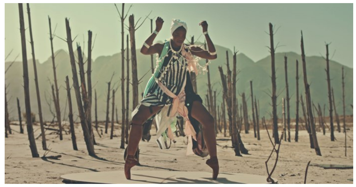
The agency turns 40 years old.

The agency has seen it all, the end of apartheid South Africa, the 2008 financial crisis and the Covid-19 pandemic.