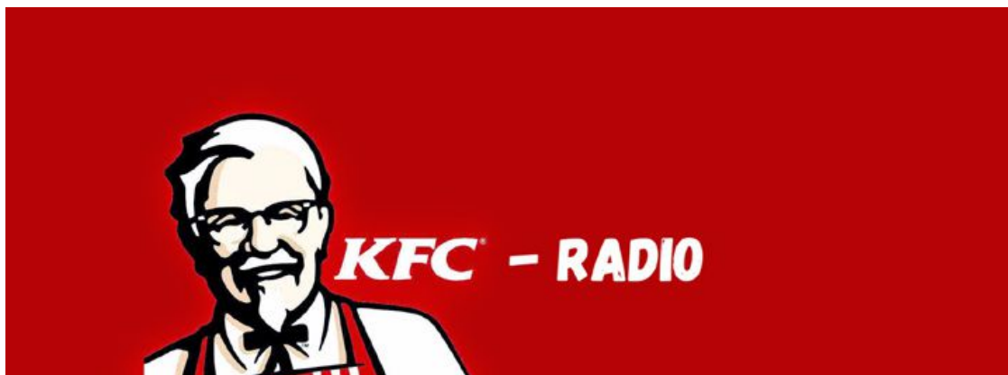
KFC - "Good burns vs Bad burns"

Check out the award-winning campaign below: