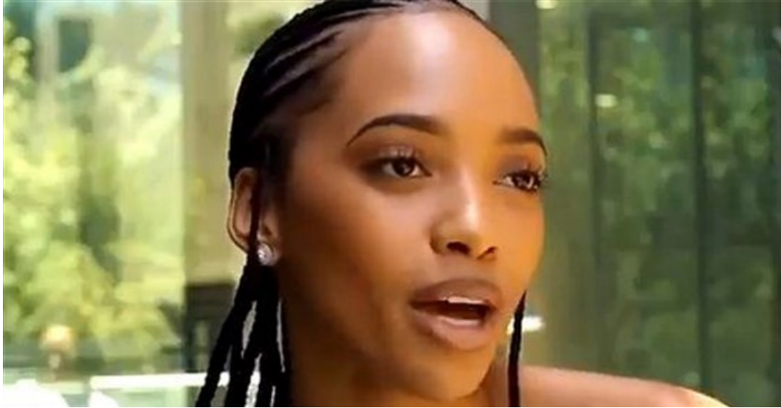
A screen grab from the ANC ad.

MSC Cruises' Orchid-worthy print ad spells romance, beauty and freedom - but trashy McDonald's gets a super-sized Onion.