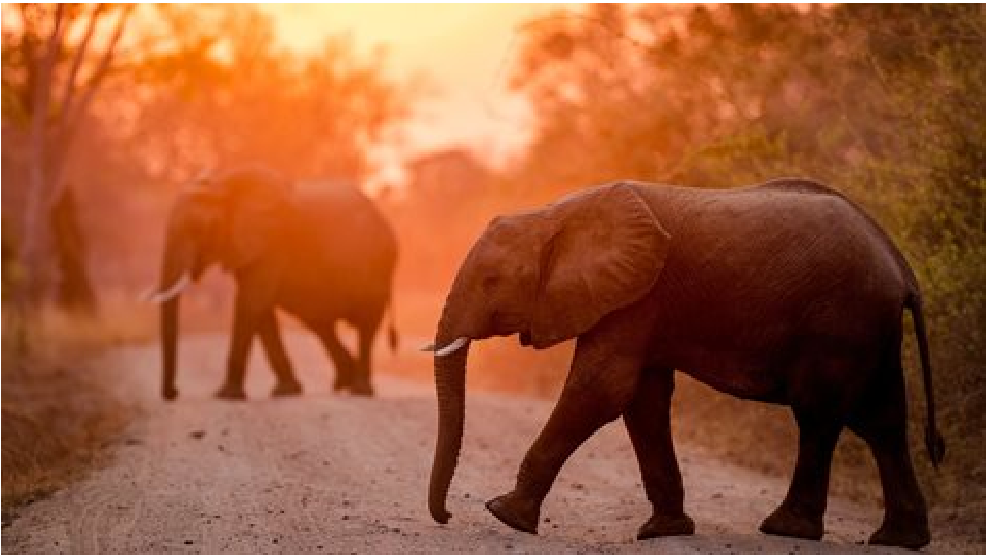
Elephants 2 Rudi van Aarde

The research team realises that great effort and socio-political will is needed to make such connections.