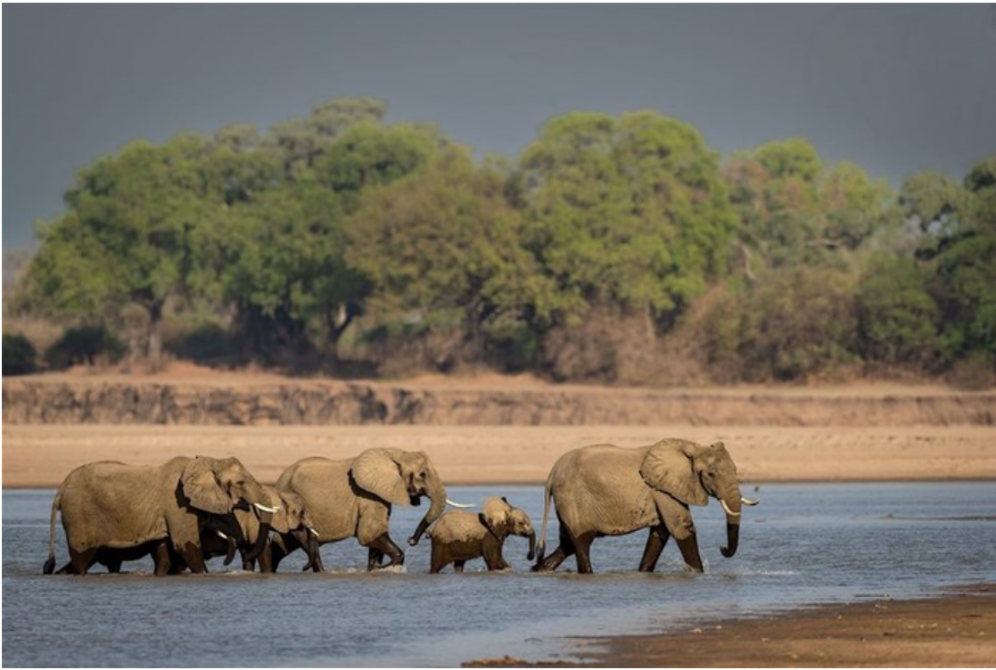
Elephants 3 Rudi van Aarde