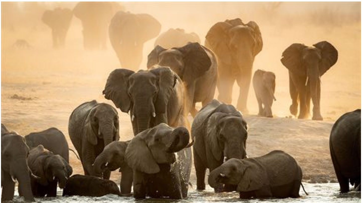
Elephants 1 Rudi van Aarde

Reconnecting natural areas and enlarging protected estates are possible solutions, and align with the guiding principles of the Global Deal for Nature , a plan proposed by researchers that outlines what it will take to maintain a liveable planet. Connecting existing protected areas with one another could ensure the viability and continued existence of populations of large-bodied herbivores, including elephants.