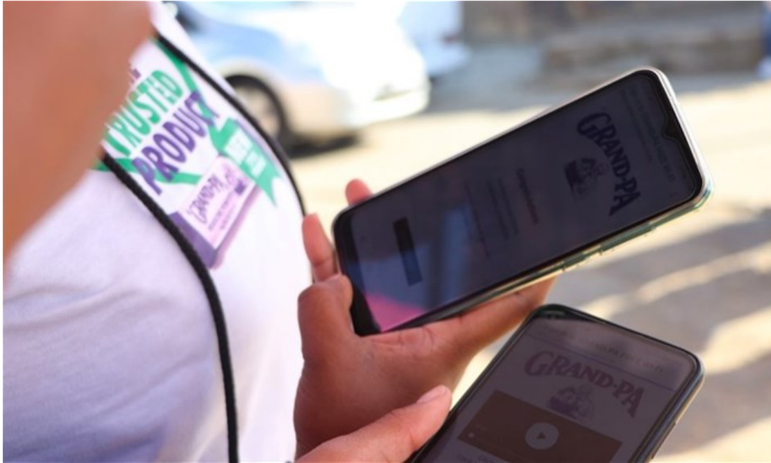
Grand-Pa activation in Tembisa

Startups, small business and micro-entrepreneurs are enjoying a 'connected hand-up' thanks to the expansion of free Wi-Fi zones across Gauteng's townships. These Wi-Fi spots can be found in bustling townships such as Dobsonville, Naledi, Diepkloof and Tembisa to name a few.