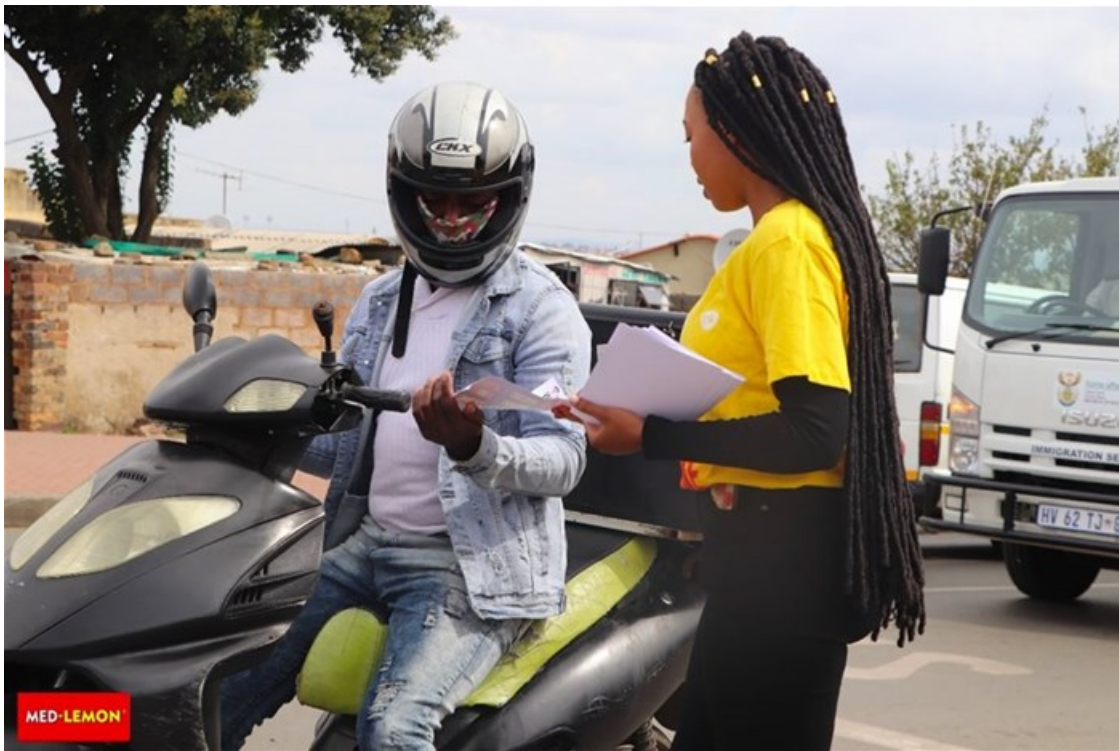
Med-Lemon activation in Soweto