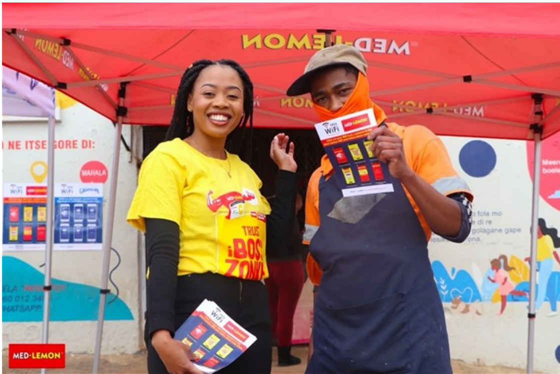
Med-Lemon activation in Soweto

“Through the Wi-Fi service, we have been able to simultaneously increase brand exposure for consumer brands and offer a ‘connectivity lifeline’ for small business. We’re boys from the kasi, our roots run deep, so we’re always looking for ways to give a hand-up to young township startups. We’re putting our money where our mouth is and doing everything, we can make the small business circle bigger,” concludes Molefi.