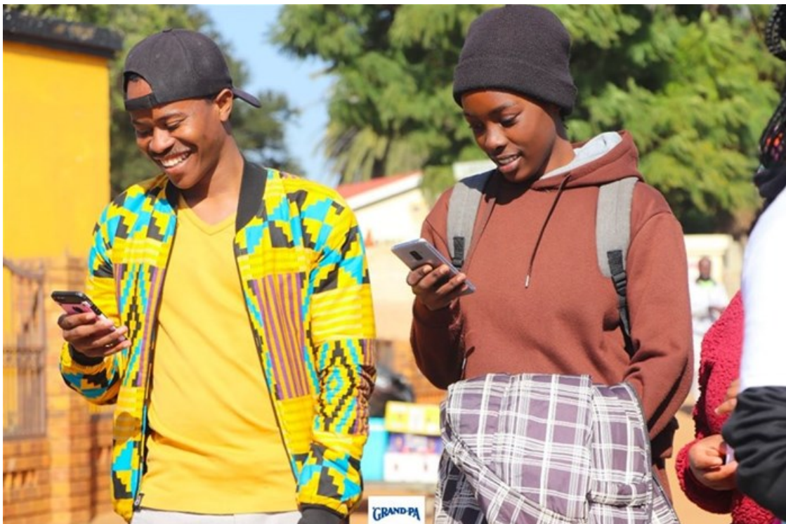
Grand-Pa activation in Tembisa

He says his team identified spaza shops as an ideal and central location within townships to market consumer brands and to enable small business owners with free high-speed Wi-Fi solutions. The company’s free Wi-Fi zone solution was first introduced in 20 Tembisa and Soweto spaza shops in 2021 and since it has proven a hit for both brands and consumers. Indaba Media is on a huge expansion drive in Soweto and other regional township communities.