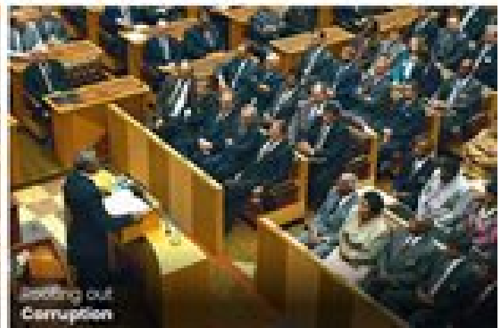
Rooting out Corruption