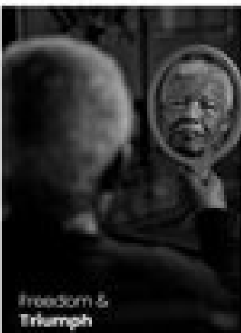
Freedom & Triumph