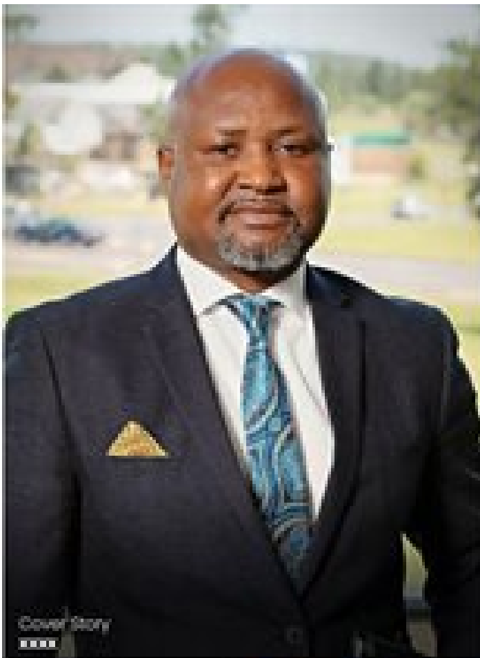
Cover Story xxxx