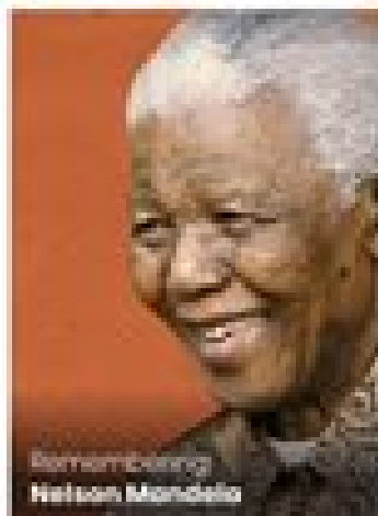
Remembering Nelson Mandela