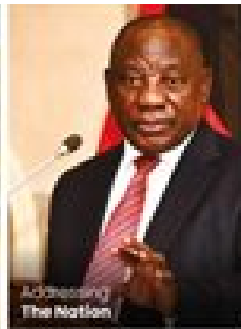
Addressing The Nation