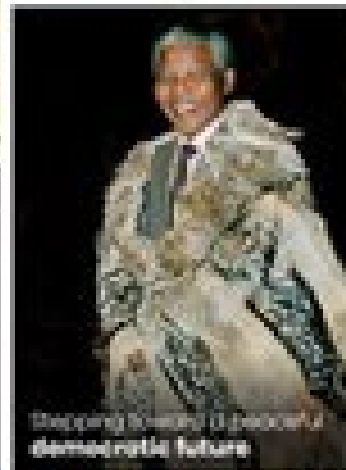
Stepping toward a peaceful democratic future