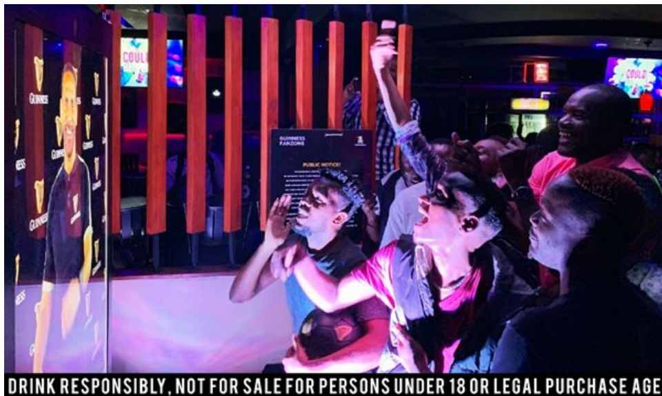
Guinness Rio Ferdinand Live Billboard Campaign

A total of 7 awards were awarded to Carat South Africa which included their Guinness Rio Ferdinand Live Billboard Campaign as well as number of awards for the re-launch of Absa.