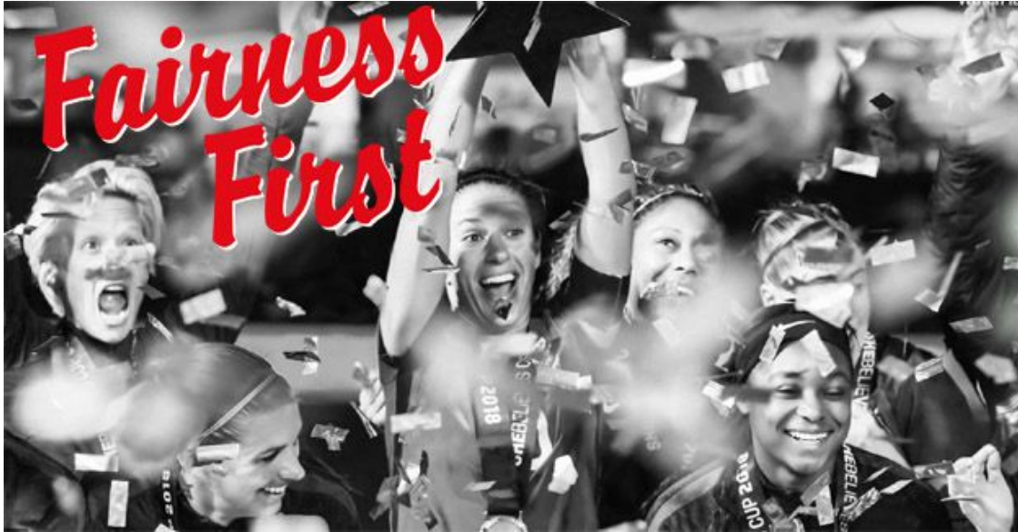
Screen grab from Nike's 'Never Stop Winning' ad.

Nike's recent run of 'Dream Crazy' ads have won more than just global recognition for their strong push towards inclusion and equality - they're also proving that brands really do make more consumer impact when they put consumer's causes first and foremost.