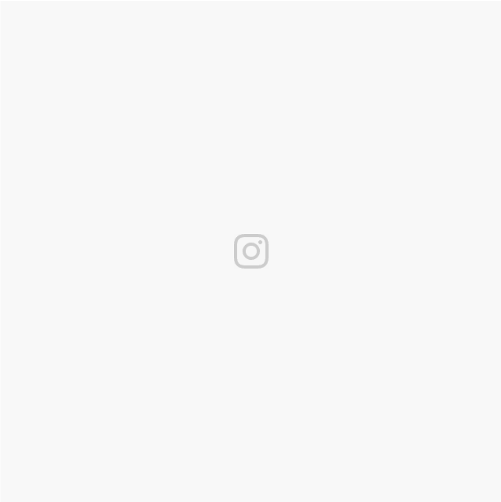
Amazing photo taken by @heidiville A photo posted by Devils Pool and Victoria falls (@victoria_falls_) on Jul 10, 2014 at 12:02am PDT